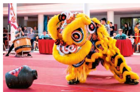
女子与少年组冠军的精彩表演。 Awesome performances by the Women's and Youth Champion teams.