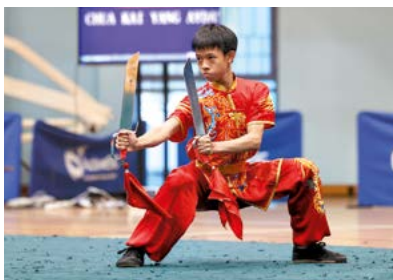
2023 Pesta Sukan(体育节)全国武术锦标赛的运动员都使出浑身解数！ Athletes at the Pesta Sukan in action!