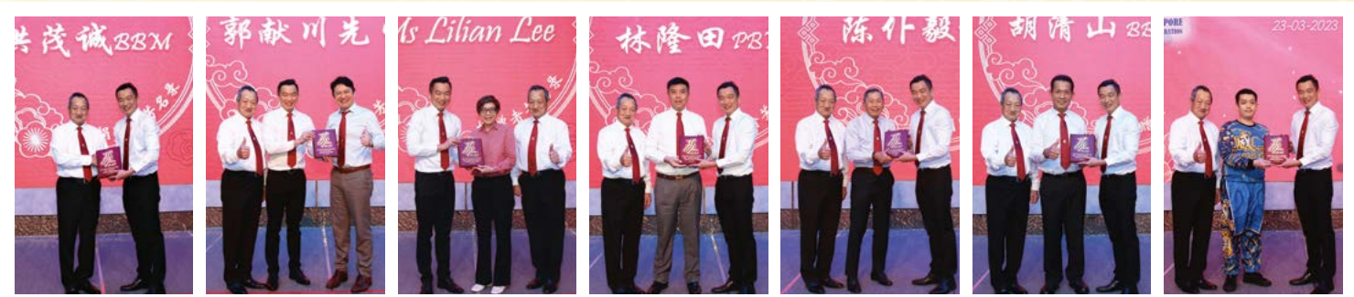
这场联欢晚宴得以成功举行，要感谢赞助商的慷慨解囊。 This celebration event would not be possible without the generous donations in cash and in kind from these sponsors.