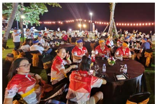
通过考试后考生的轻松时刻。 Time for relaxation after the examinations.