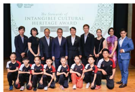
颁奖典礼结束后的大合照。 A group photo after the Award ceremony.

请扫描上面二维码以获取更多资料。 Please scan above QR Code for more details.