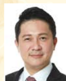
Kwek Hlan Chuan Henry 郭献川 Vice President and MP for Kebun Bahru SMC 副会长兼 哥本峇鲁选区国会议员