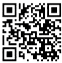
*总会网站二维码 *QRcode - website

The Sports Excellence Scholarship (SpexScholarship) provides an enhanced level of support for athletes within the High-Performance Scholarship pathway. This includes financial and programmatic support to prepare athletes to excel at the Major Games at Asian and World levels. It also assists athletes in their education, career, and personal development with the aim of developing role models for Singapore's youth and playing leadership roles in their respective communities.