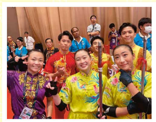
为新加坡夺得了一枚铜牌的三位运动员开心合照。 The happy trio after winning a Bronze medal for Singapore.

The Team had done Singapore proud by winning 2 Gold, 3 Silver and 1 Bronze at this SEA Games and having matched the best away results achieved at the last SEA Games in Vietnam.