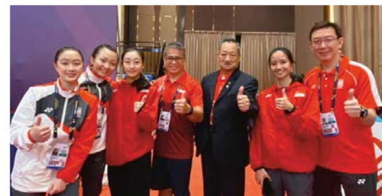
唐振辉部长在百忙之中亲临武术比赛现场 探访参赛的我国武术运动员。 Minister Edwin Tong visited our Wushu athletes at the competition site to lend his support.