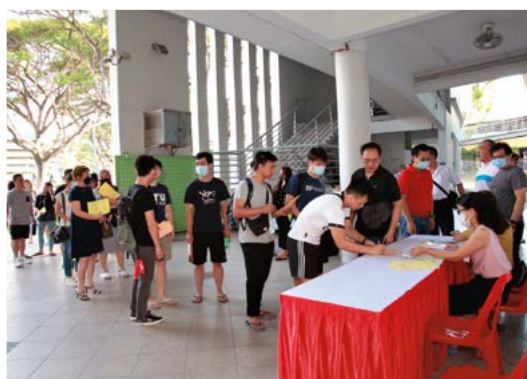
属会代表及受邀嘉宾抵达会员大会现场时签到的场面。 Members and guests signing in their attendance upon arriving at the AGM site.