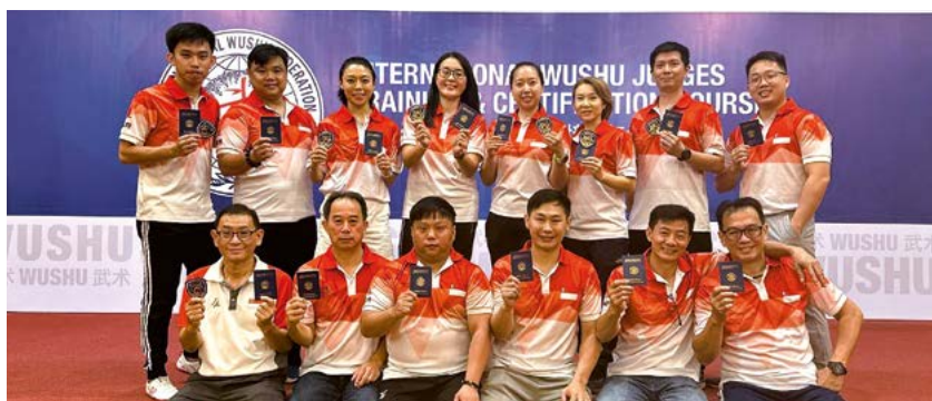
参加2023年国际武术裁判员培训及认证课程的我国代表。 Our participants at the International Wushu Judges Training and Certification Course 2023.