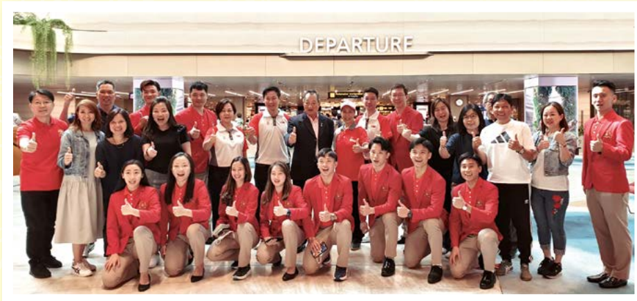
上机飞往柬埔寨金边前来个团体照。 A group photo before departing for Phnom Penh, Cambodia.