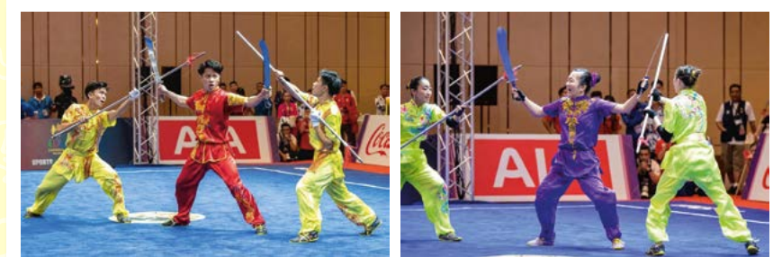
这一届的东运会武术比赛增设了男、女对练项目。 The newly included Men's & Women's Duilian events at the SEA Games.