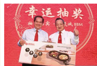
联欢晚宴上也有幸运抽奖。 There were Lucky Draws at the celebration event.