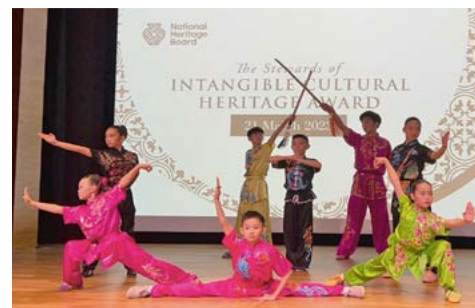
国家武术队受邀在颁奖典礼上呈现表演。 Our National athletes performed at the Award ceremony.