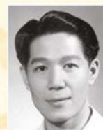
Jek Yeun Thong Minister 易洞堂部长 (1971 - 1980)