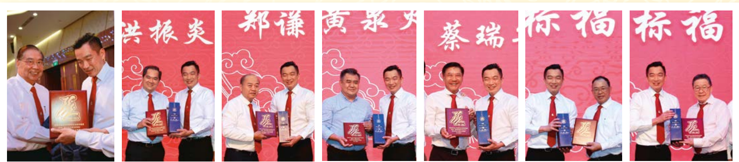
联欢晚宴上也进行了一场竞标活动，以筹集活动资金。 A bidding session was also conducted to raise fund to cover the costs of organising this celebration event.