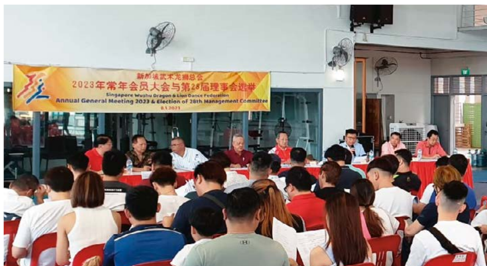
在总会勿洛会所练武厅举行的2023年会员大会。 The 2023 Annual General Meeting held at the Bedok Office Training Hall.

The 2023 Annual General Meeting (AGM) was held on 8 January 2023 at our Bedok Club house, followed by the Election of 28 th Management Committee (MC). 112 representatives from our member organisations attended and elected 26 members for the 28 th MC.