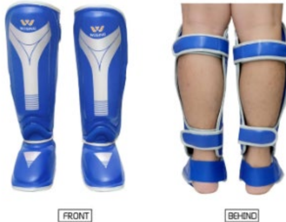
Foot Protectors 护脚