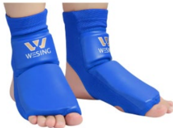
Instep Guards 护脚背